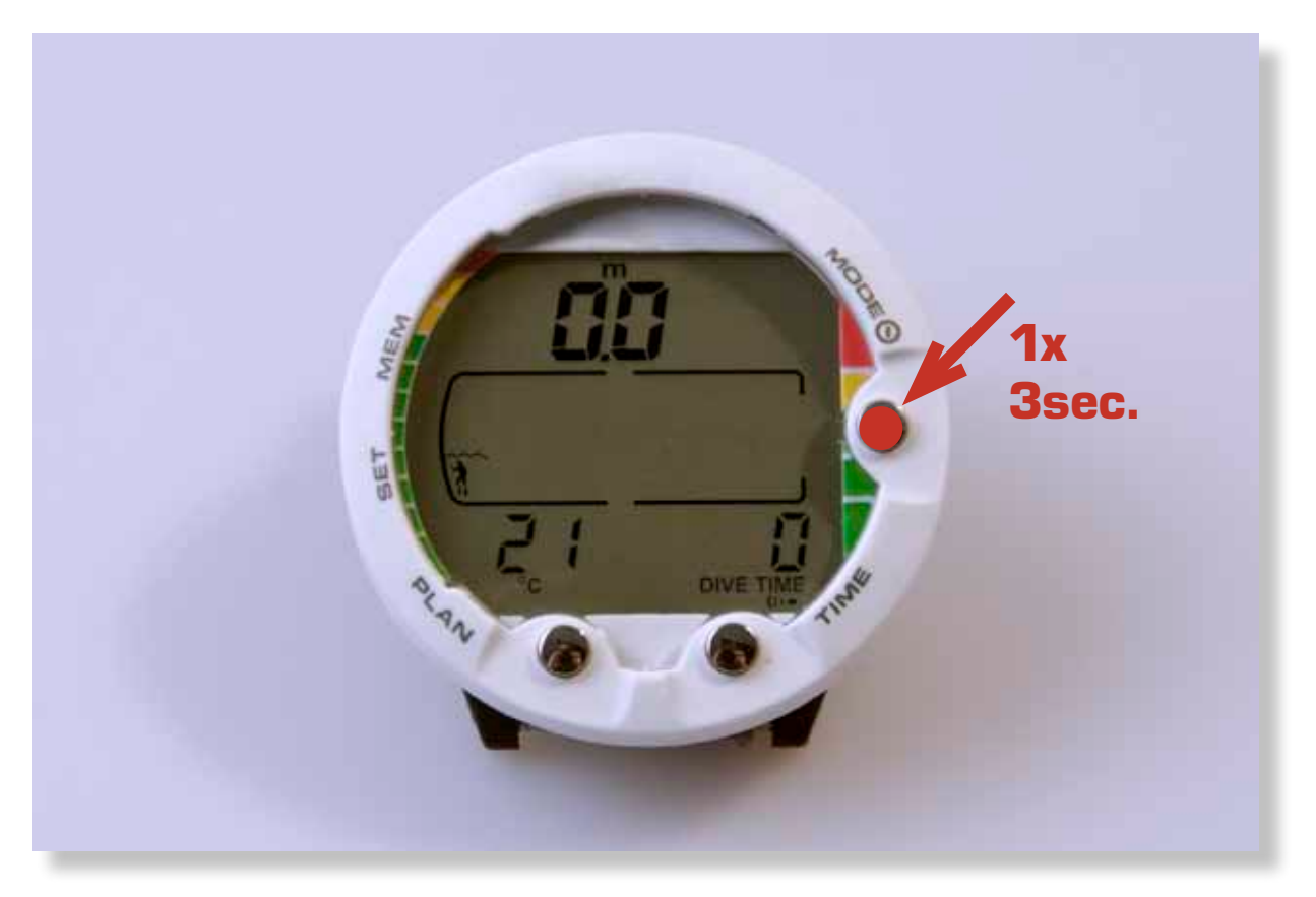
3.0 Switch On Dive Computer (TC) "Push Mode" Button 3 seconds.