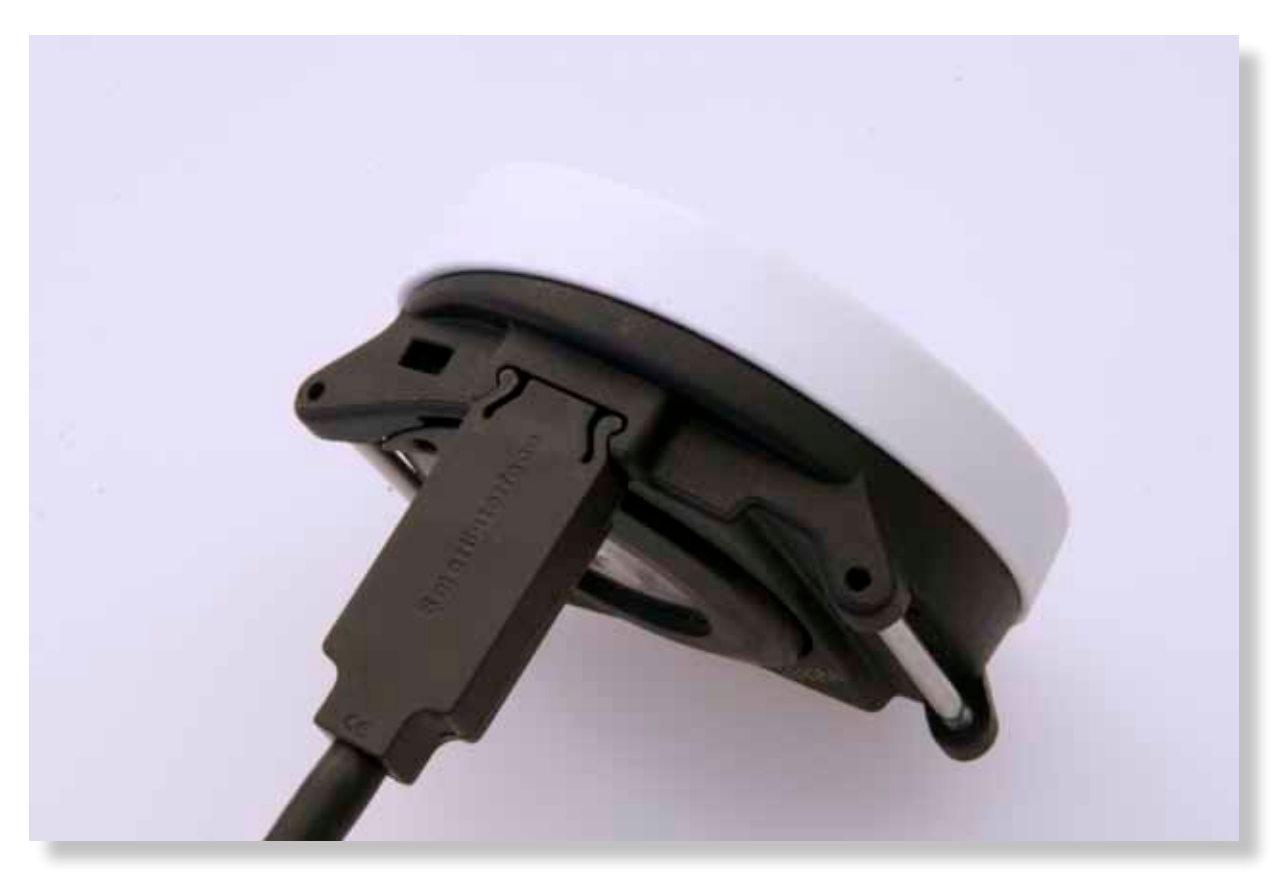
4.1 The Connector is protected against polarity reversal and will lock in the Divecomputer with low pressure.