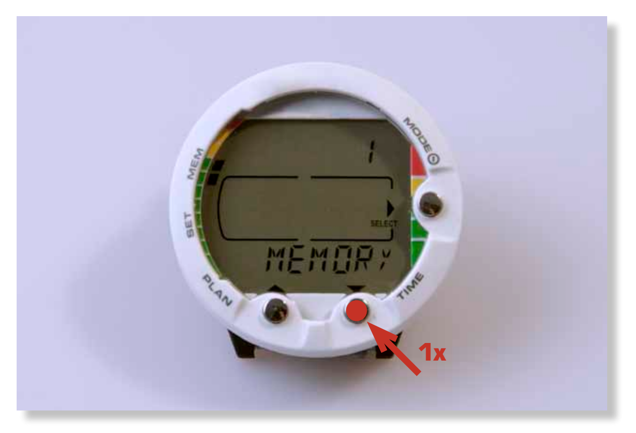
3.2 Push "Time" Button once.