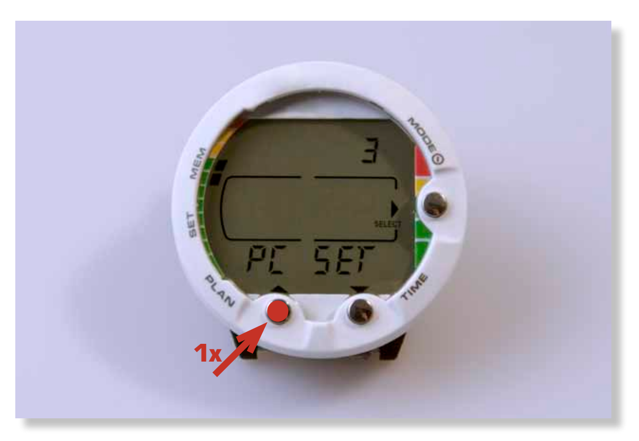
3.4 Push Button "Plan".