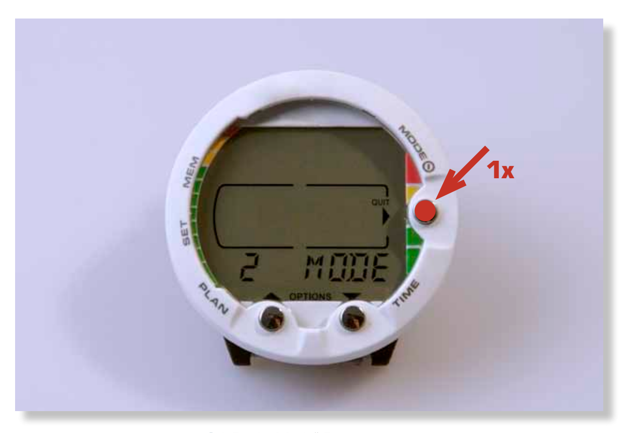
3.1 Push "Mode" Button once.