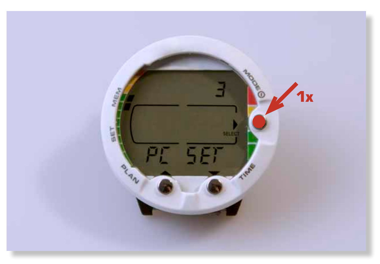
3.5 Push "Mode" Button again. Now the TC is in "Transfer Mode"