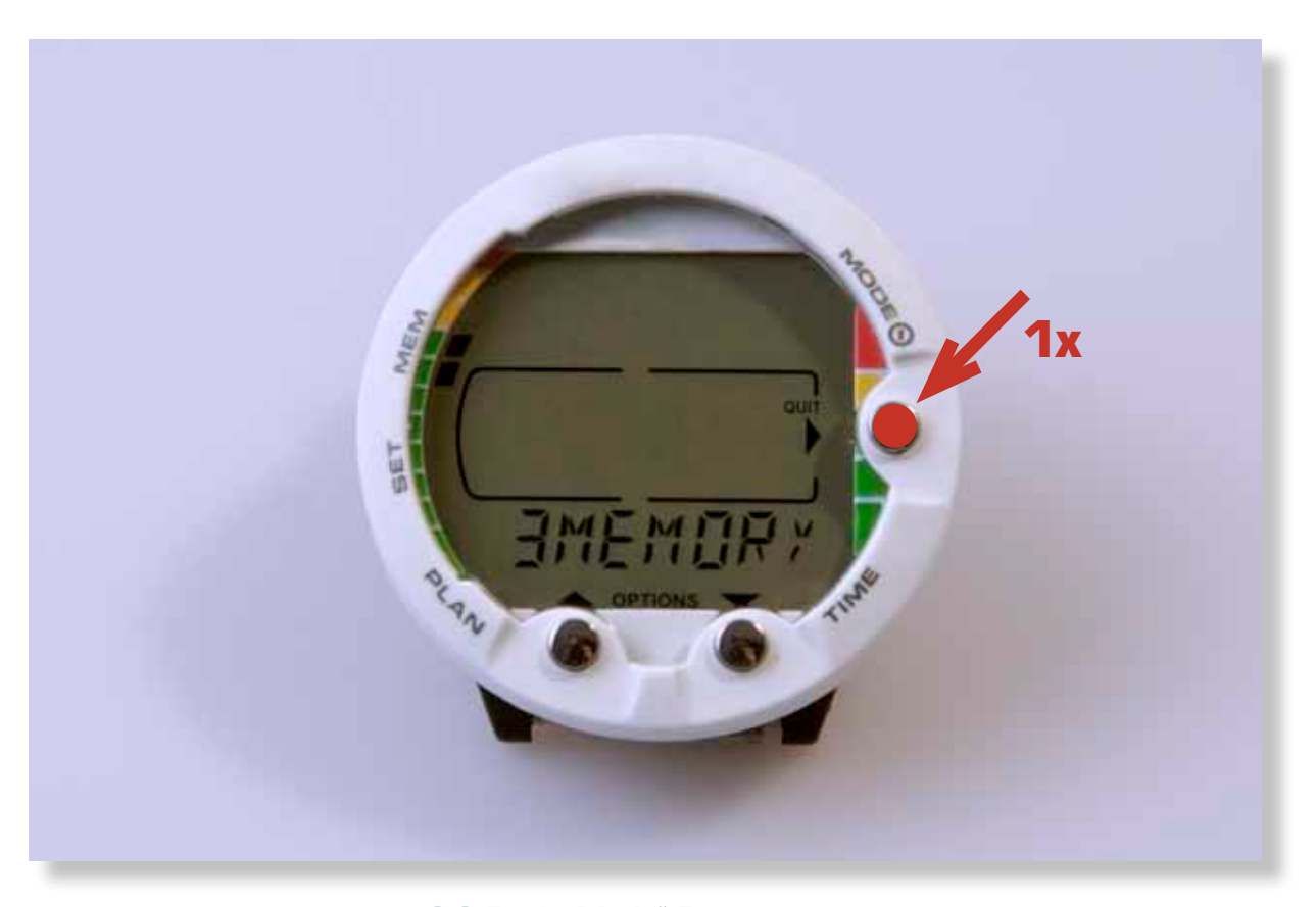
3.3 Push "Mode" Button once.